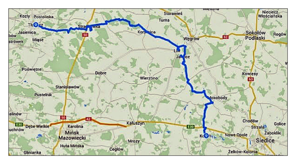
Fig. 1 The River Liwiec basin

Normalisation of variables was based on the method of zero unitarisation. The character of the