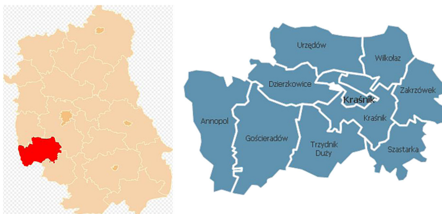
Fig. 1. Map of the Lublin Province featuring Kraśnik County and its communes [www.portalgospodarczy.eurząd.eu]

development pattern and hamlets. The smallest group are the villages with dispersed and irregular development patterns and the villages with concentrations of single farmsteads located outside the main village area.