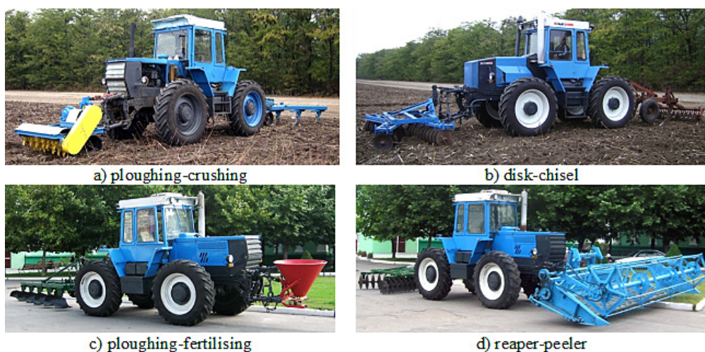
Fig. 3. Experimental combined machine-tractor aggregates; a) ploughing-crushing, b) disk-chisel, c) ploughing-fertilising, d) reaper-peeler

The third scheme for assembling the combined machine-tractor aggregates is the most promising. The advantages of such aggregates are that the mass and traction resistance of the frontally mounted sections of the machines or implements increase the vertical load upon the front traction wheels of the means of energy, increase their adhesion to the soil and reduce towing. As a result, the conditions for using the power of the means of energy improve due to the redistribution of loads across its bridges, labour productivity increases, and specific fuel costs are reduced. In many cases, the metal consumption and the kinematic length of the aggregate are reduced, which leads to a decrease in the width of the headland and the non-productive losses of time during the movement of the combined machine-tractor aggregate on it. However, to assemble combined machine-tractor aggregates according to such a scheme, an energy device with a frontal hitch is required. It is quite desirable that it also have a front PTO shaft, a reversible control post or reversible transmission, an engine with two power levels, etc. On the basis of experimental tractors, a number of schemes of the new promising combined machine-tractor aggregates were developed (Fig. 3).