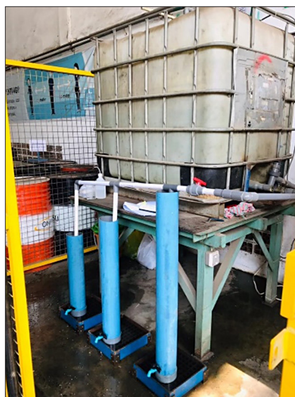
Figure 3. Experiment tool

On the basis of Table 1, the media thickness variation of 40 cm, 60 cm, and 80 cm resulted in an average pH of 7.47 after the given treatment from 7.08 before treatment, average pH of 7.70