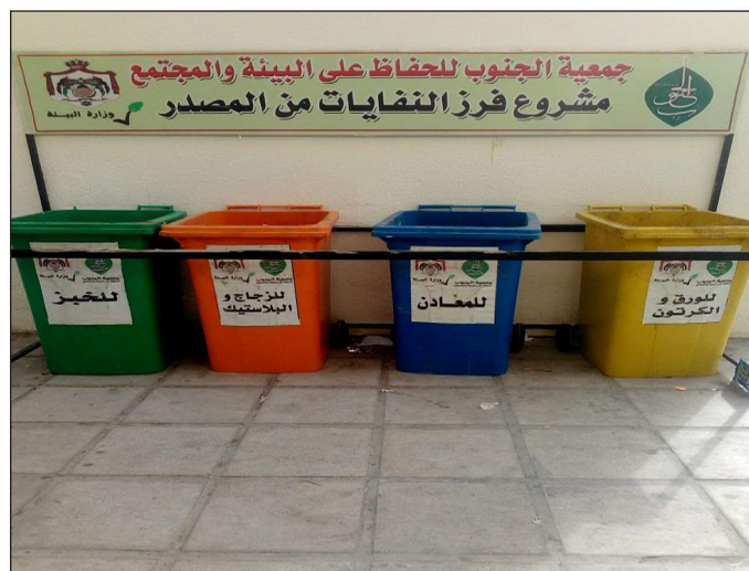
Figure 2. Waste collecting and Sorting containers. The yellow bin is for paper and cardboard, the orange is for glass and plastic, the blue is for metals, and the green is for bread

daily from the University and the eight schools using a mini vehicle with a crew of two persons. The collection process started after school time (3:00 pm). After completing the manual sorting processes and weighing all the waste fractions from the eight schools, the waste was filled into plastic bags and disposed of by the municipality crew to the landfill.