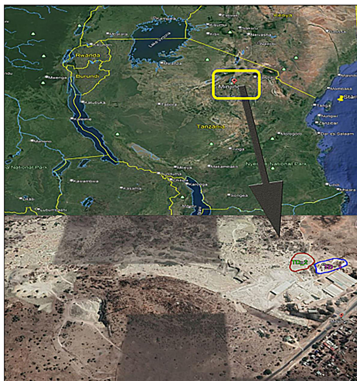
Fig. 2. The satellite image shows the geographical location of Minjingu Mines

g composite phosphate tailings sample was taken in each sampling location and put in a plastic bag and labelled. The samples were transported to the Tanzania Atomic Energy Commission (TAEC) laboratory in Arusha for analysis. The samples were dried for 24 hours at 100 °C in an oven. In order facilitate homogenization, the dry samples were crushed and put through a 500 µm sieve.