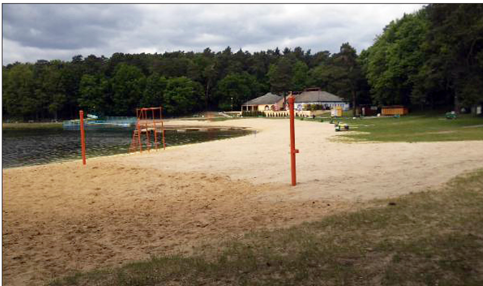
Photo 1. The municipal bathing beach by the Deep lake in Szczecin (27 th May, 2015)