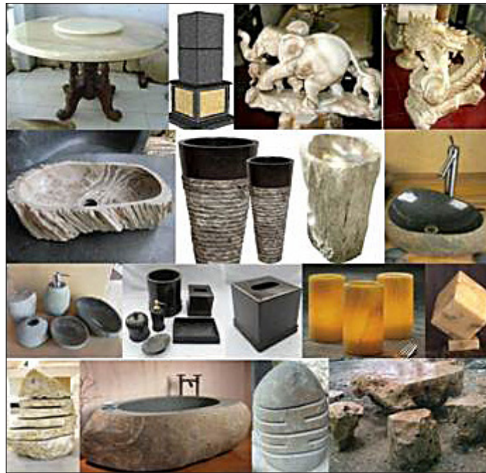
Figure 1. Example of marble and natural stone crafts in Tulungagung industries center

However, the global market demand has been forcing the craftsmen to apply eco-innovation practices. According to Kemp & Pearson (2007), this kind of eco-innovation practices is called as ‘passive eco-innovator’ which are implementing eco-innovation without using a specific strategy to eco-innovate.