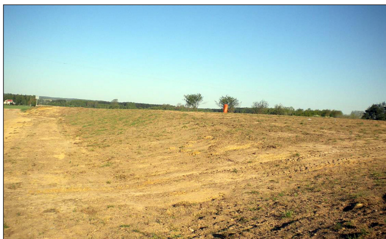
Figure 2. Reclaimed landfill site in Kolonia Lipsk

The water level in the analyzed piezometers has changed (Table 1). The highest level of water table was observed in June and December in piezometer No. 1, it exceeded 20 m, in June – 20.83 meters and 20.61 m in December, respectively. This was probably due to high precipitation. The lowest level of water table was