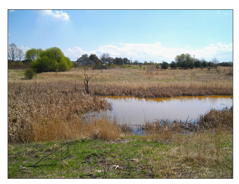
Fig 2. View of the study area

specific gravity, compactness, saturated conductivity coefficient, porosity, soil pH, organic matter content, electrolytic conductivity, depth of the root zone, aggregate stability and sodium content. Computations of PI may include all above mentioned soil parameters or only several selected ones. The productivity index may be determined on the basis of the equation: