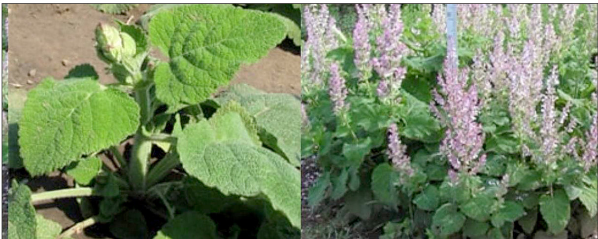
Figure 1. General appearance of the plant S. sclarea L.

S. sclarea L. was first grown in France in 1909, while in Ukraine it has been cultivated since 1929. The main regions of cultivation are located in the AR Crimea, Zaporizhya and Kherson regions. Even during severe droughts, the plant can still generate high inflorescence yields. The average yield of nutmeg sage inflorescence in Ukraine is 3.5–4.0 t/ha but yields ranging from 3.0 to 8.5 t/ha are also reported. The average yield