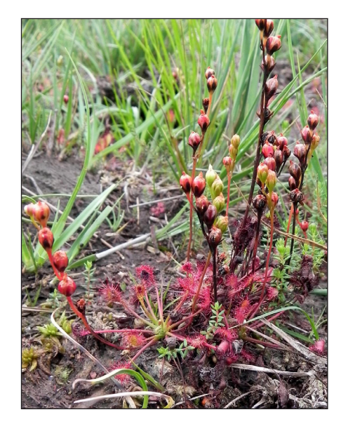
Figure 1. Drosera intermedia in its natural habitat

The test point was located near the village of Bobry, in the Łódzkie administrative district, bordering the Silesian district. It is about 15 km a