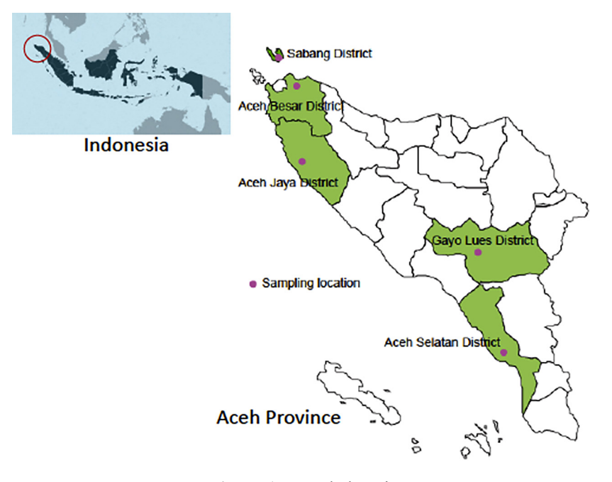
Figure 1. Sample locations

chopping method was preferred over mechanical processing to minimize the loss of volatile compounds that might occur with excessive heat or mechanical stress. This sampling and preparation methodology was designed to minimize variables that could affect the final analysis, ensuring that any observed differences in oil yield and composition could be attributed primarily to regional variations rather than processing inconsistencies.