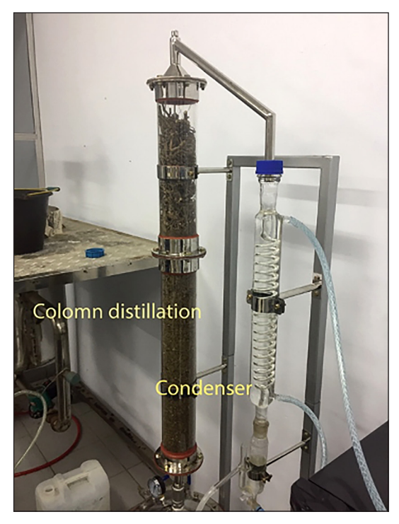
Figure 2. Photograph of the experimental setup

Compound separation was achieved using a specialized capillary column measuring 30 m in length, with a 0.25 mm internal diameter and a 0.25 mm film coating thickness. The analysis followed a precise temperature program, with the oven temperature gradually increasing from 70 °C to 220 °C at a controlled rate of 4 °C per minute. Helium served as the carrier gas, maintained at a constant flow rate of 1 ml/min. Both injector and detector temperatures were set at 250 °C throughout the analysis. Upon reaching the final temperature of 220 °C, these conditions were maintained for an additional 10 minutes to ensure complete separation of compounds. The transfer line temperature was consistently maintained at 250 °C. Mass spectrometry analysis was performed under electron impact conditions with