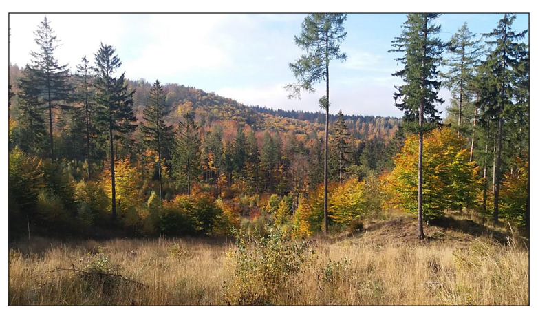
Figure 4. Reclaimed post-mining areas in Wałbrzych

the simplest but does not always yield the desired outcomes. It is necessary to consider alternative methods of managing waste heaps, including their use for construction purposes, road building, and other applications.