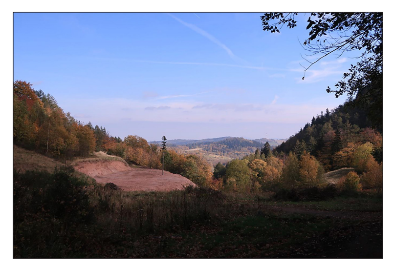
Figure 3. Post-mining landscape in the area of the heap of the "Wałbrzych" Coal Mine, Podgórze district