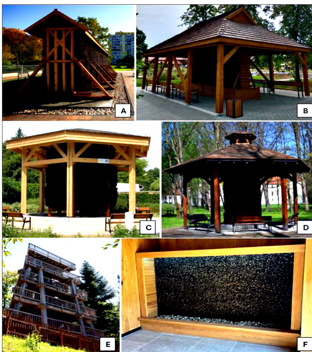
Figure 3. Architectural forms of brine graduation towers: A – longitudinal, B – longitudinal with a roof for visitors, C – central, D – central with a roof for visitors, E – observation tower, F – facade ( https://zsm.lodz.pl ; https://aranzacjekopalniane.pl ; https://www.twoja-praga.pl ; https://sucha-beskidzka.pl ; https://turystyka.glucholazy.pl ; https://dorako.pl )

A comprehensive review of the construction and layout of graduation towers revealed the presence of six distinct architectural forms (Figure 3) (Chudzińska and Dybczyńska-Bułyszko, 2019): longitudinal (a), longitudinal with a roof for health resort visitors (b), central (c), central with a roof for health resort visitors (d), observation tower (e), and facade (f).